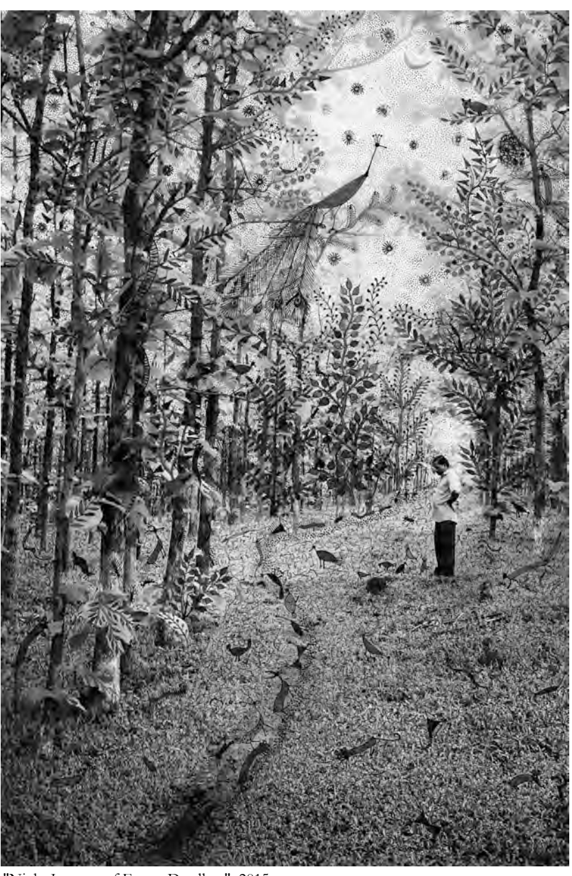
"Night Journey of Forest Dwellers", 2015

Similarly, in "Night Journey of Forest Dwellers" the artists deny the possibility of a singular reading through strategic renderings of space. The omnipresence of the forest dwellers, whose black outlines ground them within the pictured black and white landscape, suffuses the photograph with Vangad's memory of land – creating an atmosphere of Vangad's generation. His slight hunch takes on a proprietary attitude among the creatures, which both kindles my self-identification and its converse, my voyeuristic distance. As he looks down, I look down at the things that make themselves known to him (and to me), and the surreptitious creatures that are realized on the photographic form.