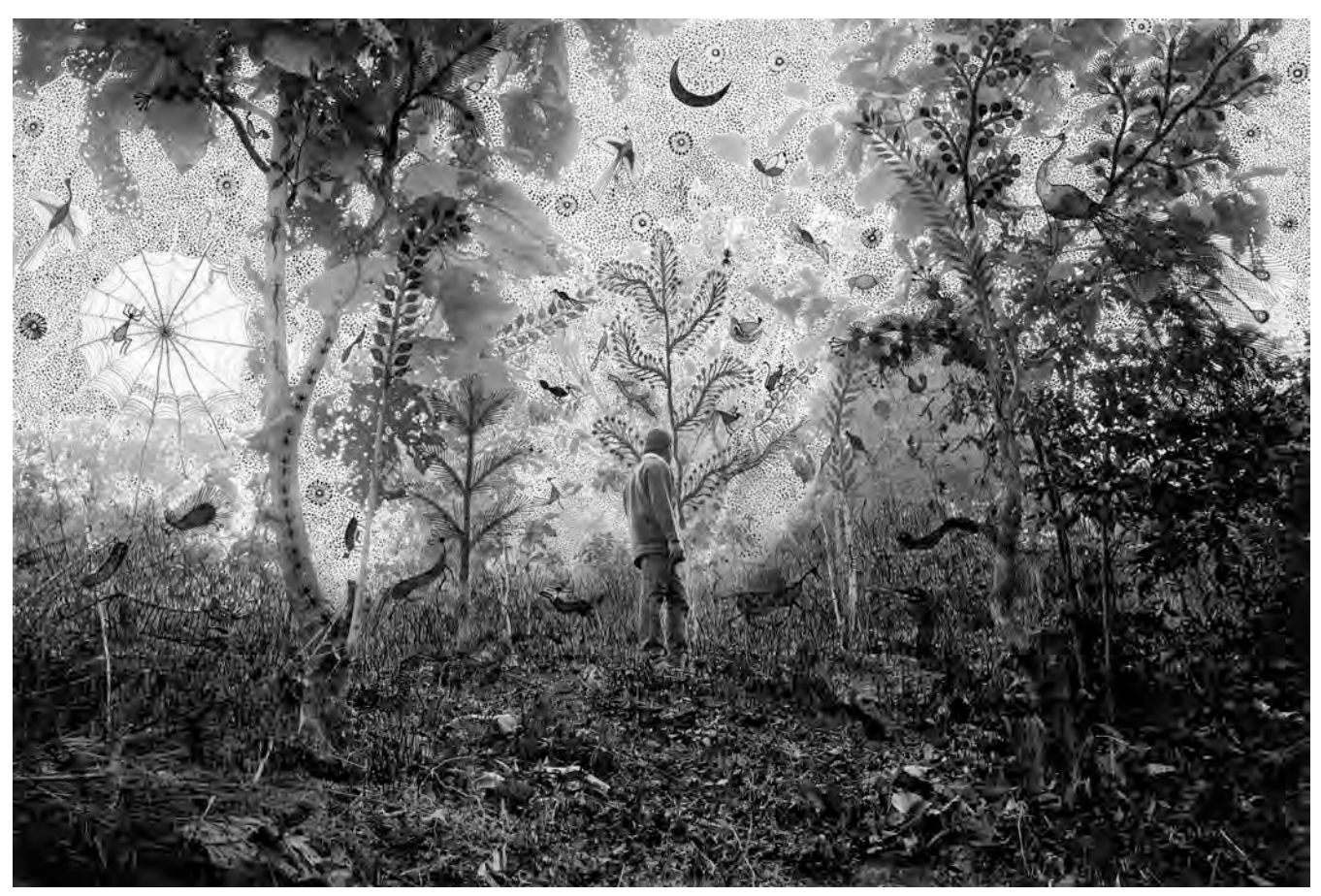
"Moonlight in the Forest", 2014

"Moonlight in the Forest," an overpainted photograph featured in the project demonstrates the productive challenge of entering into Fields of Sight through discrete readings of Vangad and Gill's forms, concepts, or iconographies. Furthermore, its composition foregrounds the conceptual layering of Fields of Sight – the complicity of Gill, Vangad, as well as the photographic viewer in generating meaning. Vangad stands in the mid-ground of the picture field, with his head turned away from the camera. The profusion of vegetal imagery imaginatively suggests Vangad's focus on depths of forest inaccessible to the photograph's viewer. The life drawn into and onto the landscape weaves an organic net over the photographic surface – organic both because of its subject matter and its hand-drawn style (which might be considered 'organic' at least compared to the camera's technological language). The teeming veneer and the crescent drawn into the upper picture field solicit the viewer's eye to view the metallic day sky of the print as the silver incandescence of moonlight.