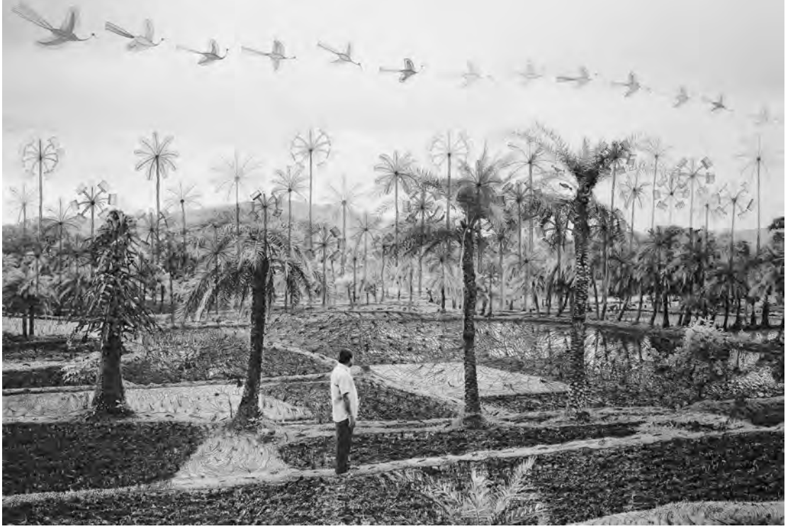
"Harvest II", 2015

Gill's framings, which are vast and infrequently draw attention to the foreground, further open the immersive capacity of the works. In "Harvest II" and "River" among other works, her frames allow the viewer to move into their not-as-yet-visible depths in an imaginative resistance of rational time and photographic space. Challenging the conventionality of rural landscape-documentary photographs, a genre with rich colonial roots and touristic resonance, Gill's engagement with land is intimate, unexpected, and determined by Vangad's selection of spaces to memorialize. Defying the 'non-style' of the snapshot aesthetic, Gill and Vangad foreground aestheticism as a documentary proposition. They redirect the orientation of the artwork from the picturing of land to the experience of space. Through the depiction of sweeping receding fields within which Vangad is most often featured alone, Gill foregrounds the silence of the photograph, training a view on the 'nearness' of his lived experience, while still instantiating the insurmountable distance of representation.