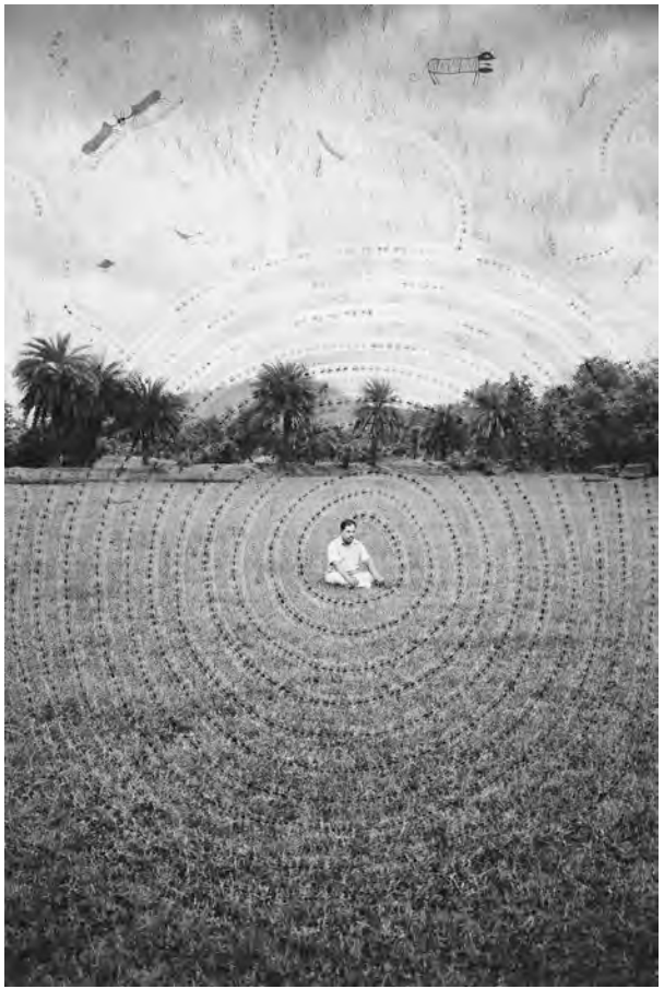
"Worship of the Great Serpent who lives in the Home of Ants", 2015