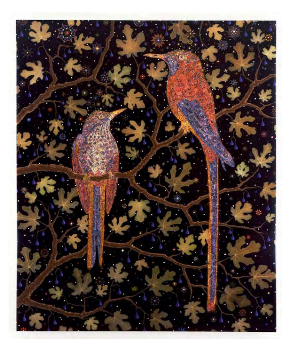
"Migrant Fruit Thugs" (2006) depicts two birds of an imagined species.

Evidence of his green thumb can be seen in a show of new works at the James Cohan Gallery in Chelsea. All of the major pieces include pressed leaves from his garden.