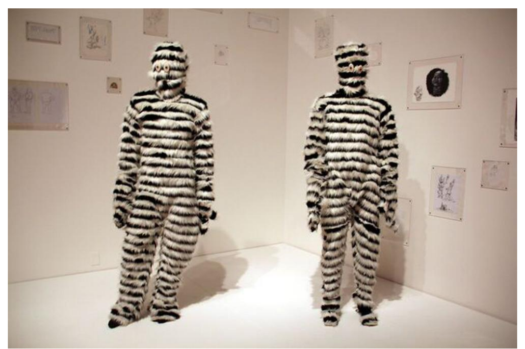
Trenton Doyle Hancock, "Bringback Figure Costume #1 and Costume #2," 2014.