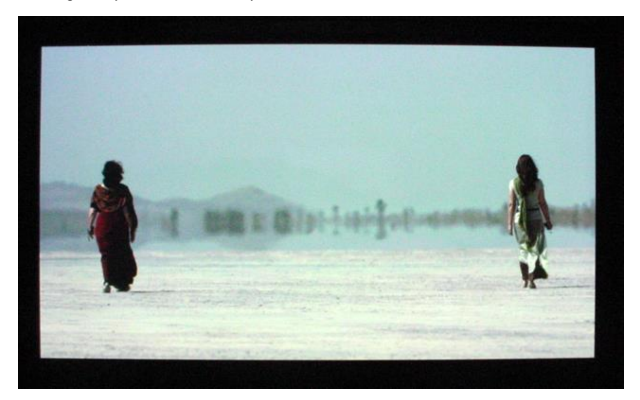
Bill Viola, "The Encounter" (2012)

If there is a gimmick in "The Reflecting Pool" — and in most of the other work presented here, except the vivid, super-slow-motion video portraits like "The Quintet of the Astonished" (2000) — it is this: suspense. Nothing much happens for what seems like an eternity. That lends the videos a stopped dream–like quality. But then there will be a burst or blast of brief and often shocking activity that tears the still-mysterious shroud asunder.