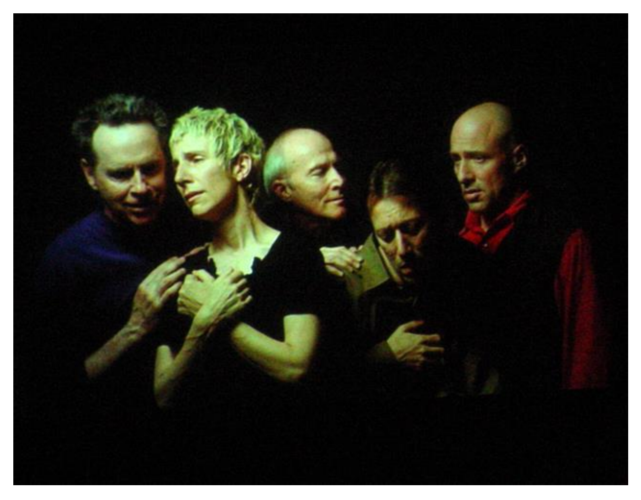
Bill Viola, "The Quintet of the Astonished" (2000)

Viola's sublime show of twenty works is cleanly installed, the sound ambient but sharp. It is largely about encounters with long, drawn-out time, stagnant or sudden immersions into water, the contemplation of heat and fire, or slightly animated hints at classical religious paintings. The intention of every work seems to be of psychic transformation, and Viola often confronts a myth-like figure in the rectangle with an elemental foil (such as heat or water) that overcomes it. This surpassing of the image into watery or hot ground is what gives Viola's work such a painterly romantic appeal while lending it its nature-based spirituality.