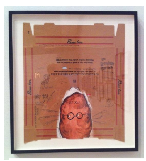
Pizza Inn: Only Mean Animals Die for Our Meat, We Promise

Placing Torpedo Boy Peeing at the front and center of the exhibition is brilliant. A box labeled "Art Boards" stand on a plinth, open to display a primitive drawing of Torpedo Boy (and his mythically large baloney pony) showering a rainbow of radioactive piss onto a pile of glued-on studio garbage. It is crude enough to make blue-hairs cringe and