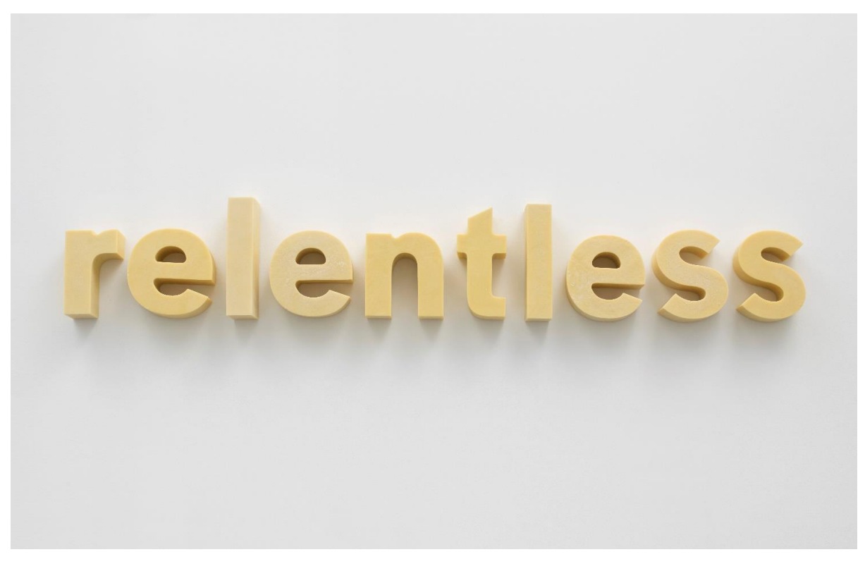
Allana Clarke, Relentless, 2021

each inextricably linked to the artist's energy and physicality. Clarke's cocoa butter works elicit a similar bond to her physical self. Individual letters are cast in rubber molds filled with cocoa butter, which are then assembled on the wall to share lines of the artist's poetry. The text stems from her relationship to the material of cocoa butter itself, reflecting on Clarke's experience of "rituals of alteration, indoctrinating [her] into a world that is anti-black."<sup>6</sup> In both processes, the artist relies on time—waiting for the materials to coagulate before next steps are taken—a condition that coincidentally, or tellingly, embodies the wait and patience needed to attain transcendence.