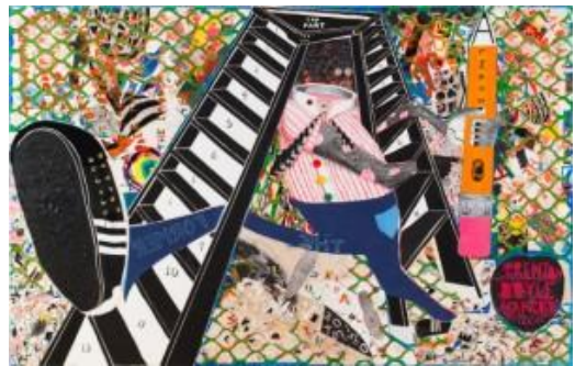
Trenton Doyle Hancock, The Former and the Ladder or Ascension and a Cinchin', 2012, acrylic and mixed media on canvas 84" x 132" x 3". © the artist.

D.H. - It looks like the jauntily dressed central figure in The Former and the Ladder or Ascension and a Cinchin is trying to do something or get somewhere, but all the objects that could be helpful to him, like the ladder, are getting in his way.