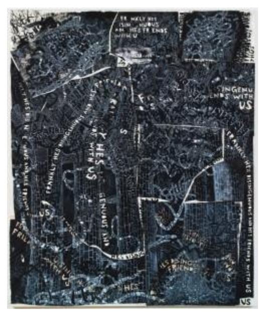
Trenton Doyle Hancock, Black Mamba, 2012, acrylic and mixed media on canvas 72" x 60" x 3". © the artist.

T.D.H. - I have here the first comic I ever had, Spiderman ; it just happens to be in my studio right now. My stepdad brought it to me when I was getting my tonsils out; I was in the fourth grade. I remember thinking, 'This is so serious. This isn't for play any longer.' Because I think the treatment that I had normally seen of comic book characters was they're on your bedspread or it's a TV cartoon. Having this pulpy thing in my hand with reading involved seemed very grown up. There was a level of seriousness in the way it was drawn and the way it was written. It was a life-changing moment.