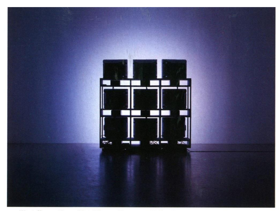
ABOVE West (Sunset in my Motel Room, Monument Valley, January 26, 2007, 5:36–6:06 PM), 2007. OPPOSITE Following Nature, 2013, at the Indianapolis Museum of Art. The patchwork of filters and glass panes re-creates the light and colors of Monet's famous garden in Giverny.

grid of nine television screens cycling through stills that gradually fade to twilight by the end of half an hour.