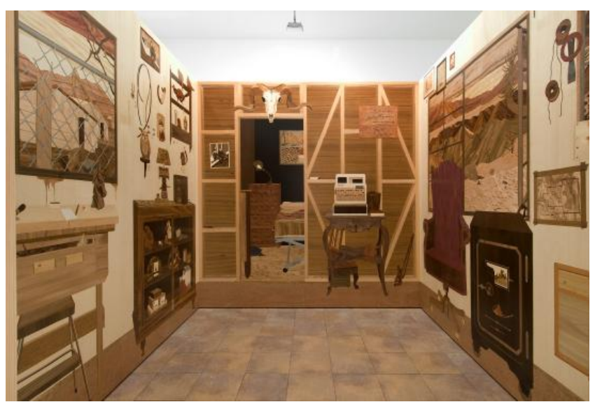
Alison Elizabeth Taylor, Room, 2007-08, Wood veneer, pyrography, shellac, 96 X 120 X 96 inches.

Taylor is interested in "harnessing the power of beauty and tethering it to difficult subjects either to contrast or draw the viewer in." [1] Her poignant use of marquetry to depict the dichotomies of our current gilded age has drawn the attention of critics, curators, and collectors alike. Her work has been celebrated with solo exhibitions and numerous grants to support her practice, as well as reception into important private and public collections, including the recent acquisition of Room (2007–08), her most ambitious and accomplished piece to-date, by the Crystal Bridges Museum of American Art. [2] This working artist and mother of two has certainly found her place at the table. Given the widespread discrepancies that still exist in museum collection holdings, solo exhibitions, market values, and other opportunities for women artists in connection to their economic and critical equality in the field, it is encouraging that an artist of Alison Elizabeth Taylor's ability has gained such swift and deserved success. [3] Many women artists of the past century have not fared so well.