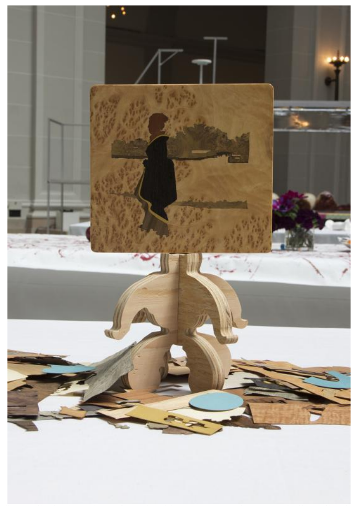
Alison Elizabeth Taylor, After Hiroshige, 2013, wood veneer, shellac, oil paint.

This paring down of materiality and form offers an economy of aesthetics that does not diminish but rather elevates the work's striking presence. Tribal, religious, domestic, and figurative motifs are synthesized as a compelling and cohesive collection via Taylor's ability to manipulate the veneer's texture in provocative ways. For example, in another of her renderings of Hiroshige's woodblocks, a cloaked figure moves through a swirling nebulous atmosphere poetically created by the wood's natural grain.