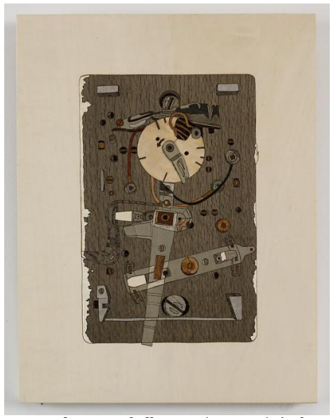
Alison Elizabeth Taylor, Thermostat, 2009, Wood veneer, shellac, 14 1/2 X 22 1/2 inches. Courtesy of The Artist / Courtesy James Cohan Gallery, New York/Shanghai